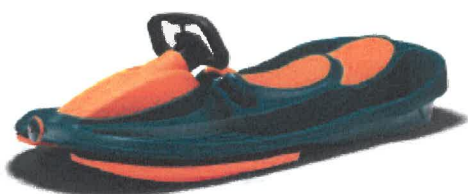
bobsledge GALACTUS Lava orange (HS 23128)