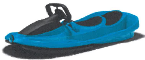
bobsledge GALACTUS Polar blue (HS 23129)